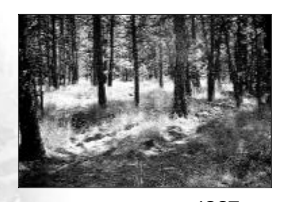
Rare plant protection and school education Deschutes County near Sisters - 160 acres